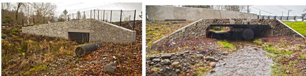
Figure 2.5.6C-1 Enhanced Design Example

Enhanced designs are used in highly visible settings. Surface treatments are accomplished with standard form liners from the Standard Specifications and Qualified Products List.