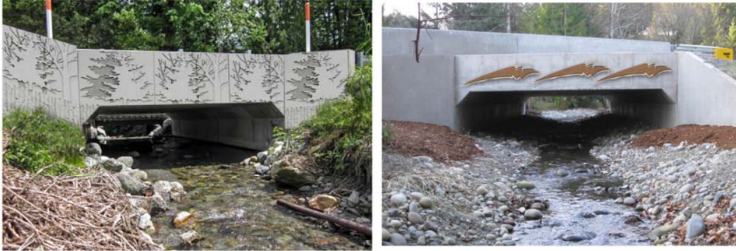
Figure 2.5.6B-3 Refined Design Example

Refined designs are used in high profile settings requiring community input and may serve as public art. These designs are accomplished with common construction methods and materials.