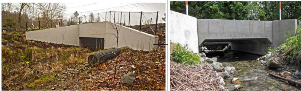
Figure 2.5.6B-1 Basic Design Example

Basic designs utilize class two smooth concrete that is seen by almost no one. Class two finish is described in Standard Specifications 6-02.3(14)B. The use of pigmented sealer is dependent on the risk of graffiti.